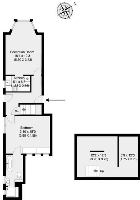
Ground Floor (59.2 sqm / 637.2 sqft)

Approximate Gross Internal Area 80 sqm / 861 sqft